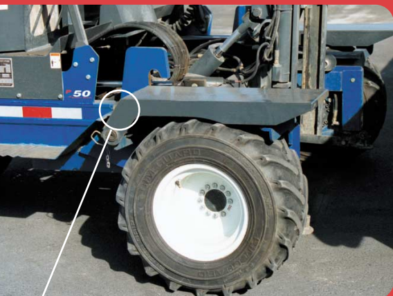
* Drywall package

"Power, Stability, Optional Double Reach or 4 Way Steering make the Piggy Back® the most versatile drywall delivery system available."